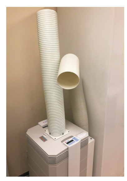
Figure 6 Portable HEPA filter unit.

72 hospital workers with SARS found that the likelihood of SARS infection was strongly associated with the perceived inadequacy of PPE supply, insufficient infection control training, and inconsistent use of PPE<sup>[29]</sup>. In the Ophthalmology