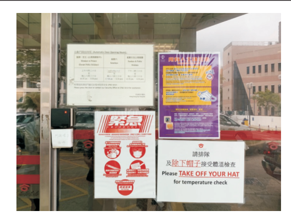
Figure 1 Signage at the hospital's main entrance alerting incoming patients to undergo temperature check and to wear a surgical mask.

Eye Bank The HA Eye Bank, which supplies donor ocular tissues to the whole of Hong Kong, is situated within Hong