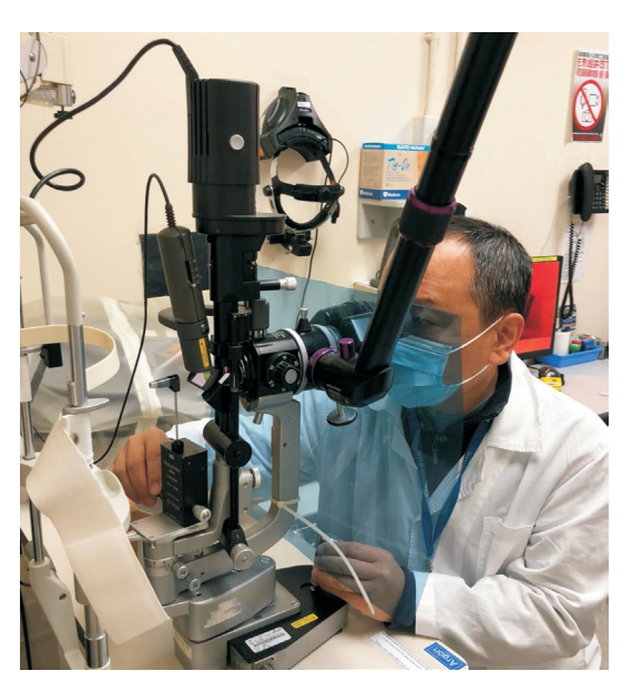
Figure 7 Slit lamp fitted with plastic breath shields.

72 hospital workers with SARS found that the likelihood of SARS infection was strongly associated with the perceived inadequacy of PPE supply, insufficient infection control training, and inconsistent use of PPE<sup>[29]</sup>. In the Ophthalmology