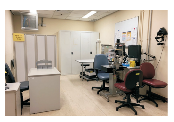
Figure 5 Designated consultation room for fever cases/cases fulfilling COVID-19 reporting criteria, equipped with neutral air pressure and an air purifier.

Figure 4 Screening questionnaire for COVID-19.