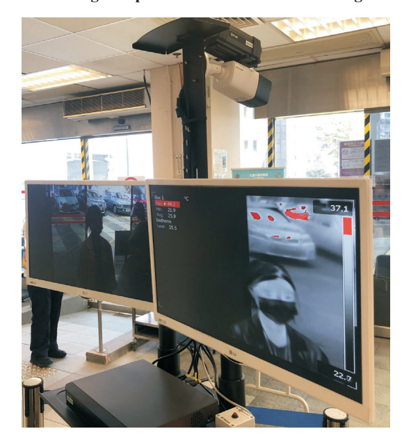
Figure 2 Infrared body temperature screening system located at the main entrance of the hospital.

Kong Eye Hospital. Since non-urgent clinical services have been reduced as per Hong Kong HA directives, active solicitation for donation of ocular tissues has been temporarily suspended, resulting in a 70% reduction of ocular tissue donation. Donor corneas are currently only obtained from voluntary donation initiated by donor family, multiple organs donors, and referrals from other staff. These donated corneas, as well as our stock of frozen corneas, support the current demand in emergency operations. With recommendations from Eye Bank Association of America (EBAA)<sup>[24]</sup>, the criteria for acceptance of potential donor corneas have been modified. The additional criteria include: 1) Potential donors did not have fever or lower respiratory symptoms; or if they did, it was not related to COVID-19; 2) The death of donor was not related to COVID-19; 3) The donor did not have travel history to an area with active community COVID-19 transmission.