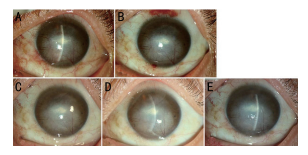
Figure 2 The effect of subconjunctival conbercept in patient 3, a 49-year-old man with chemical injury in the left eye complicated by corneal scarring, and neovascularization A: Baseline picture shows two main vessel branches emerging from the 12-o'clock and 5-o'clock position at the limbus and passing into the depressed scar in the corneal mid-periphery where it branched several times into smallercaliber vessels. B, C, D, E: 1d, 1, 2wk, and 1mo after subconjunctival conbercept.

Figure 1 Outcomes of corneal neovascularization (CNV) parameters at five different time points A: CNV area; B: CNV length; C: CNV diameter. Compared with before treatment, <sup>a</sup> P <0.05, <sup>b</sup> P <0.01, <sup>c</sup> P <0.001. The significant therapeutic response which was evidenced as early as 1d, then peaked at 2wk, and reduced at 1mo.