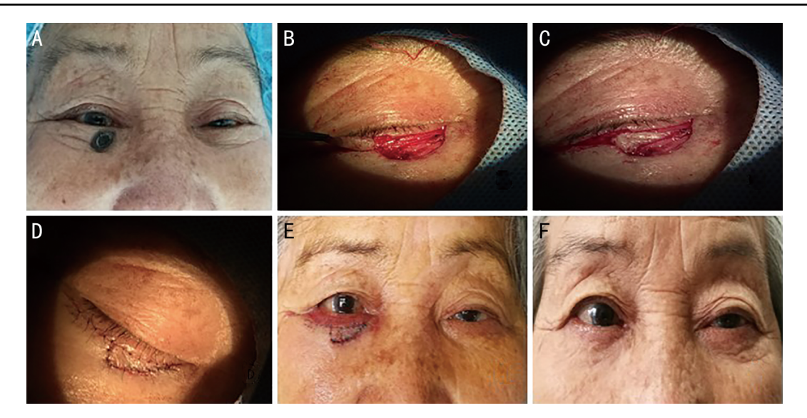
Figure 2 Microscopic reconstruction with the subcutaneous pedicled propeller flap technique for a defect in the anterior layer of the eyelid after the excision of a basal cell carcinoma A: Preoperative photo. The tumor is in the center of the right lower eyelid near the eyelid margin. B: Anterior eyelid defect after tumor removal. C: A subcutaneous pedicled propeller flap is rotated 180° to cover the defect area. D: Appearance immediately after repair with microscopic sutures. E: Early postoperative appearance. F: Final postoperative appearance.