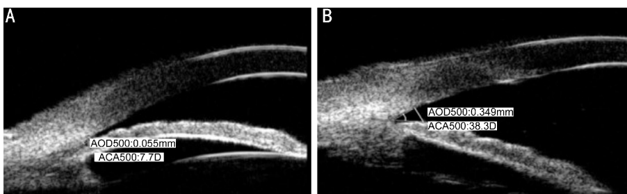
图3 手术前后A组前房角变化 A:术前;B:术后。

对于手术后前房的变化及与眼压的关系,我们正在进行进一步的研究。因此,我们认为透明角膜切口白内障超声乳化术治疗青光眼滤过手术后白内障视功能恢复稳定,眼压能有效控制,并能进一步降低闭角型青光眼的眼压。术前对患眼全面评价及适当的手术技巧有助于手术效果的提高,且减少并发症的发生。