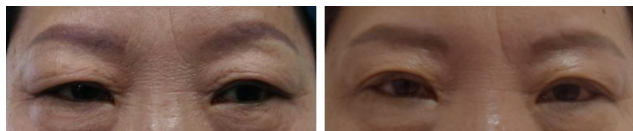
Figure 2 A 57-year-old woman, preoperation and 6mo postoperatively.