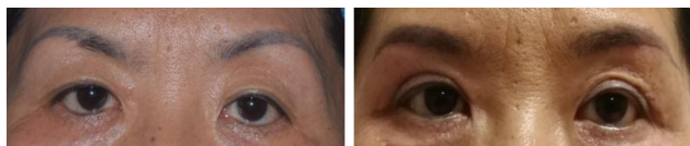
Figure 3 A 61-year-old woman, preoperative and 6mo postoperatively.