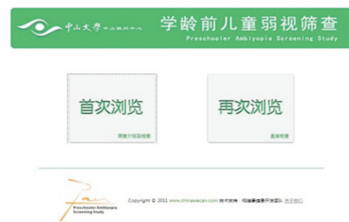
Figure 2 First page of the amblyopia screening software.

rechecked by retinoscopy; 48h later, the best corrected visual acuity by standard logarithmic visual acuity chart with tumbling-E optotypes (Precision Vision, La Salle, IL) under bright light at a distance of 3 m would be measured. Examination of eyes: with the professional methods and instruments of the ophthalmology such as slit lamp microscope, the direct ophthalmoscope and focus pocket lamp etc, the targets were conducted to undertake the inspection of objective ocular region, especially the cover-test at far and near fixation.