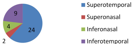
Figure 1 Quadrant involved in tears/breaks.

Of the 41 patients, 4 (9.75%) patients had macula attached RRD at the time of presentation. The rest 37 (90.24%)