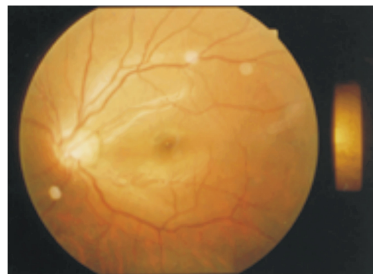
Figure 2 Fundus photography of left eye (normal)

was high myopic (-20.0 diopters) and his best-correct vision was CF/10cm in the right eye. Slit-lamp examination and intraocular pressure were normal. The fundus showed a retinal detachment adjacent to the morning glory disk anomaly. There was a tiny slitlike break near the margin of excavation at the temporal side. The macular of the patient looks yellowish (Figure 1). The left eye was unremarkable (Figure 2). The patient did not have hearing problems and systemic examination was unremarkable. The patient was diagnosed with the morning glory syndrome with retinal detachment and amblyopia in right eye. The patient underwent a pars plana vitrectomy with removal of the posterior hyaloid, fluid-air exchange, laser endophotocoagulation to the temporal margin of the excavated disk and