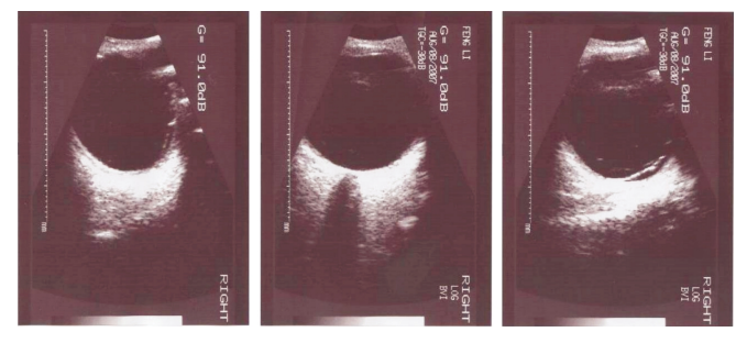
Figure 2 B ultrasonic examination of the right eye shows the temple retina detachment.