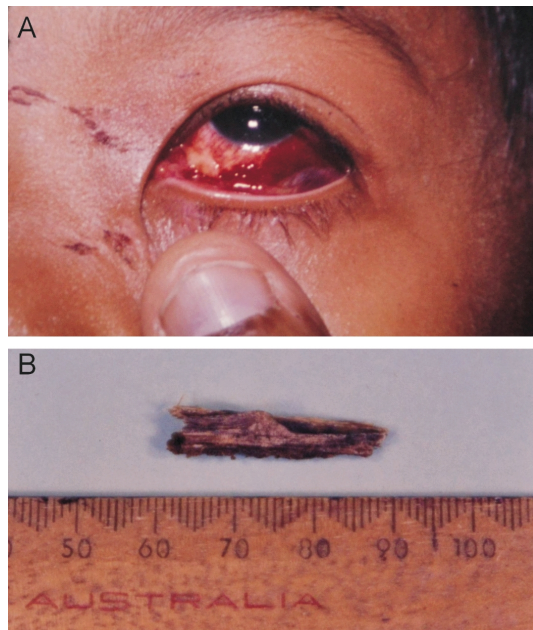
Figure 3 A: showing the subconjunctival haemorrhage in the lower temporal quadrant and the black spot; B: the removed wooden foreign body.

for two days followed by oral ciprofloxacin 100mg bd, along with gentamycin eye ointment tds in left eye. The oedema of lower lid and chemosis of conjunctiva in the lower fornix disappeared on third post operative day. His ocular movements were normal. Vision was 6/9 in both eyes. Oral antibiotic was stopped after five days. He was discharged on gentamycin eye drops tds in left eye He was followed up at three weeks interval for two months. Subconjunctival haemorrhage disappeared in the first follow up visit. Gentamycin eye drops were stopped. In the second follow up visit, his best corrected vision ( -0.50 \times 180^\circ ) was 6/6 in both eyes. He was further followed up once in two months for six months. At the last follow up, vision and ocular movements were normal in left eye.