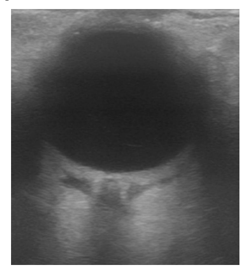
Figure 2 Diffusion of the local anesthetic solution in the peribulbar, in the retrobulbar and in the sub-Tenon's spaces after a peribulbar block.

The advent of ultrasonography will probably change the consideration of the efficacy because we will be able to follow in real time the spread of the local anesthetic solution in different spaces <sup>[5]</sup>. Magnetic resonance imaging showed that after a combined peribulbar and retrobulbar block the volume of local anesthetic solution spread throughout the globe, and after a retrobulbar and a sub-Tenon's block, the local anesthetic solution accumulates behind the globe [6-7]. Authors determined the distribution of anesthetic fluid during 3 regional anesthetic techniques (sub-Tenon's, peribulbar, and retrobulbar) routinely used for phacoemulsification. After a sub-Tenon's injection the fluid around the optic nerve developed a characteristic T sign. In the retrobulbar technique the fluid was localized within the cone and with a peribulbar administration the fluid was seen in the extraconal fat. They did not noticed a characteristic T sign after a peribulbar or a retrobulbar<sup>[8]</sup>.