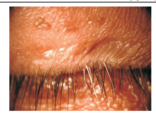
Figure 1 Characteristic of CD.

Eyelash Sampling and Microscopic Detection of Demodex spp. Eyelash sampling was performed for each case; lashes with CD were considered (Figure 2A) under examination by slit-lamp microscopy (Model SL-D7; Topcon, Tokyo, Japan) at a magnification of 16×. Eight lashes were removed from each case by fine forceps, four from the left eye and four from the right eye. For each eye, two lashes were removed from the upper lid, and two were removed from the lower lid; a lash from each of the upper and lower lids was placed separately on a glass slide. The coverslip was mounted onto each lash before slowly pipetting a drop of normal saline solution to the edge of the coverslip; each slide was examined under a microscope at 10× and 40× magnifications (Figure 2B). All slides were sent