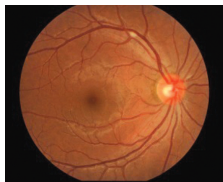
Figure 1 Initial fundus photograph from the patient who was diagnosed as MVR at the first visit and developed CMV retinitis during the follow-up. Cotton-wool spot was shown in the superotemporal retina of the right eye.

CMV retinitis is the most common eye disease leading to