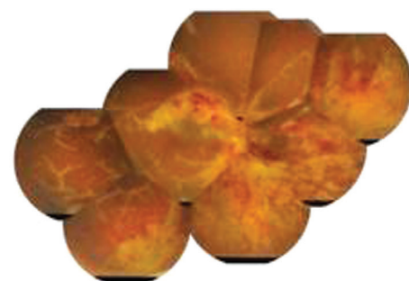
Figure 3 Fundus photograph of the same eye after 9mo displayed the typical CMV retinitis changes with extensive retinal necrosis and hemorrhage.

blindness in AIDS population. Early diagnosis for CMV retinitis could effectively control disease progress, prevent other serious complications and retain the patient’s visual function.