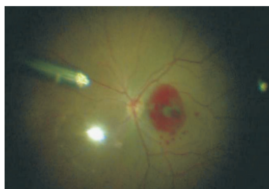
Figure 1 In group B, autologous blood was dripped after ILM transplantation.

Vision There were 16 cases in group A with higher BCVA than preoperative, and the improvement rate was 84.2%. In group B, 16 cases were improved, the improvement rate was 88.9%. BCVA was significantly improved compared with