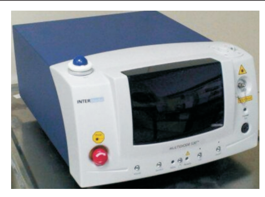
Figure 1 Multi-diod laser TM S30-OFT device.

After operative site antisepsis using povidone iodine 10%, the upper and lower canaliculi were dilated using Bowman probes. A rigid nasal endoscope with a 0-degree angle was inserted into the nose. Multidiode laser (Intermedical Multidiode S-30 OFT; Figure 1) was used. The settings were adjusted for each patient being at 10 W energy, 400ms pulse, 400ms pause and contact mode. The radius of the diode laser fiberoptic probe used was 600 µm. This probe was introduced into the lacrimal sac through the upper and lower canaliculi, until the transillumination of the aiming beam could be seen via the nasal endoscope just lateral and superior to the middle turbinate. Of 980 nm diode laser was applied until the largest possible osteotomy was achieved. The area of ostetomy was expanded to approximately 8-10 mm in diameter, and coagulated using diod-laser, carbonized tissue was removed under endoscopic guidance. Nasolacrimal passage was irrigated using 0.9% NaCl from both upper and lower punctums. In all subjects, bicanalicular intubation was performed. Totally 23-gauge silicone tube was then passed through the inferior