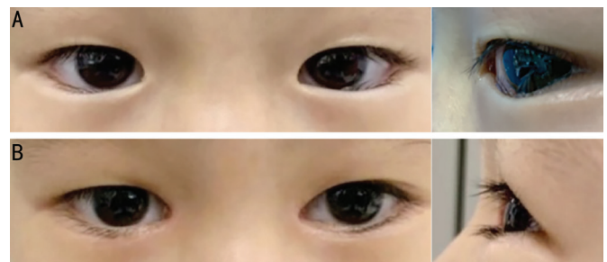
Figure 3 A comparative photograph of a seven-year-old boy who underwent the described procedure A: Pre-operation; B: 4mo post-operation.

Analysis of refraction at the first visit showed a mean spherical error of 0.21 \pm 2.15 diopter (D) for the right eye and 0.25 \pm 2.21 D for the left eye. Astigmatism of \geq 2.0 D was found in 28 of the 36 (77.8%) eyes, and was largely WTR (32 eyes or 88.9%) and only oblique in 4 eyes (11.1%). The mean astigmatism before the operation in the right and left eyes was 2.37 \pm 0.69 and 2.41 \pm 0.91 D respectively, and the mean astigmatism decreased from 2.39 \pm 0.79 D preoperatively to 2.19 \pm 0.79 D at 6mo after surgery; however, the difference was not significant. There was no significant shifts in the axes after the operation.