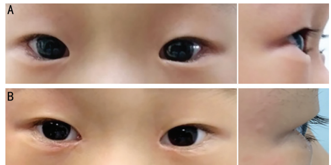
Figure 2 A comparative photograph of a five-year-old boy who underwent the described procedure A: Pre-operation; B: 4mo post-operation.

There were 15 (83.3%) patients who have a best-corrected visual acuity of 20/20, 3 patients between 20/40 to 20/80. There were 2 (11%) patients with amblyopia after full correction of the refractive error, whose best-corrected visual acuity were between 20/60 and 20/80 from meridional amblyopia. All bilateral cases improved within a few months after the operation, without patching. We compared best-corrected visual acuity before and after surgery and found that it improved; however, the change was not significant different during the follow-up period.