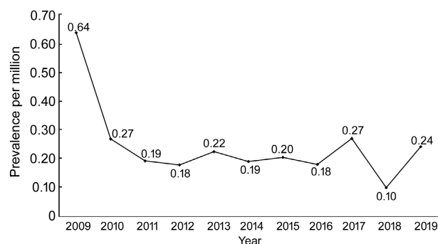
Figure 1 Annual incidence unadjusted of OCP per million from 2009 to 2019 Incidence: (New cases per year / SISPRO consulting population per year) × 1 000 000 inhabitants.

In eleven years, 112 patients had been diagnosed with ocular pemphigoid. The estimated average prevalence was 0.22