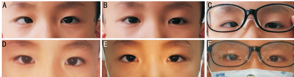
Figure 2 Ocular alignments pre- and postoperation A: CEET patient with myopia (case 3 in Table 1) underwent bilateral MR recession and Y-splitting. His esodeviation angle at near (A) was larger than that at distance (B), and was not able to reduce the near-distance disparity with bifocal lens (C) preoperatively. He had a orthophoria at both near and distance with or without the optical lens postoperatively (D, E, F).

and 1.83 \pm 1.60 PD postoperatively at distance ( P < 0.05 ). The mean esodeviation at near was 50.00 \pm 20.74 PD preoperatively and 6.83 \pm 0.98 PD postoperatively ( P < 0.05 ). The mean near-distance disparity was significantly reduced from 22.67 \pm 8.80 PD preoperatively to 5.00 \pm 1.09 PD postoperatively ( P < 0.05 ; Tables 1 and 2). Patients had achieved satisfactory surgical outcomes showing a good ocular alignment at near and distance without limitation on any gaze positions (Figure 2). In addition, their sensory status had been improved because patients who didn't have binocular vision had acquired near stereopsis or binocular vision postoperatively.