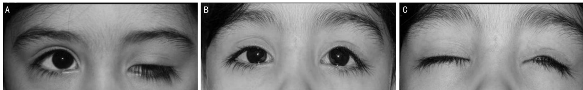
Figure 3 Unilateral congenital ptosis A: Preop. photograph of the 3 years old girl with congenital ptosis of left eye underwent TCMLR procedure; B: Postop. 6mo; C: Postop. 6mo, lagophthalmos. TCMLR: Tarsosconjunctival mullerectomy plus levator resection.