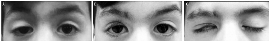
Figure 2 Unilateral congenital ptosis A: Preop. photograph of the 7 years old boy with congenital ptosis of right eye underwent sling procedure with application of silicon rod; B: Postop. 6mo; C: Postop. 6mo, lagophthalmos.