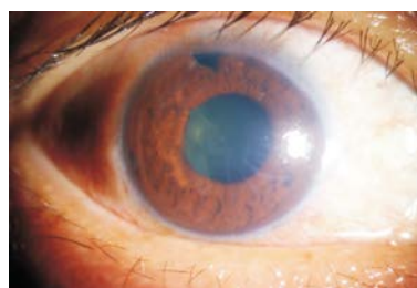
Figure 1 Anterior segment photograph showing prolapse of the toric implantable collamer lens in the right eye with corneal edema.

Endothelial damage was widely concerned for the safety after ICL implantation. Endothelial damage caused by ICL-