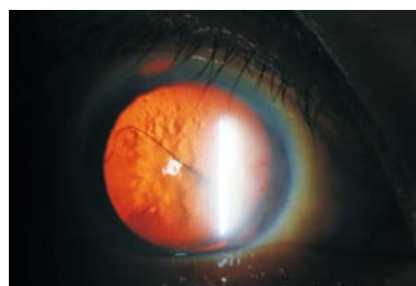
Figure 2 Largely rotated and inferiorly sublaxated toric implantable collamer lens.