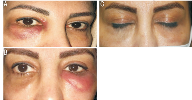
Figure 1 Face photograph A: Right lower eyelid-cheek erythema and swelling denoting a pre-septal cellulitis. Small deep grayish loci compatible with micro-abscesses. B: Late lower eyelid -cheek erythema and swelling denoting a pre-septal cellulitis. Small deep grayish loci compatible with micro-abscesses. C: Resolved erythema and swelling on the both sides after surgery and medical treatment. Post inflammatory hyperpigmentation and mild residual irregularity.

Culture of the debrided specimen showed coagulase-negative Staphylococci spp. Histology exam with H&E staining showed mature congested adipose tissue with mild chronic inflammation. She showed a remarkable resolution of peri-orbital erythema and swelling within next two weeks. She continued oral azithromycin 500 mg for three months. In six months follow up, peri-orbital swelling, erythema and pain were resolved. There was a mild skin irregularity and mild bilateral post-inflammatory hyperpigmentation over lower eyelid-cheek (Figure 1C). Both the patient and her primary physician expressed their satisfaction. The patients expressed that she was happy enough to do any more intervention for