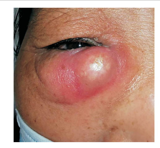
Figure 1 Patient with right acute dacryocystitis.

D-silicone intubation was conducted once the pain and swelling of acute inflammation had subsided (Figure 3). It takes 3-5d after presentation, depending on specific cases and timing. All surgical procedures were performed under local anesthesia. The inferior nasal meatus was packed with a pledget soaked in a solution containing 1:100 000 epinephrine and 2% lidocaine. After dilation of the puncta by a dilator, a probe with 5 mL syringe attempt to through the nasolacrimal duct. After confirming the patency of the lacrimal passage by saline irrigation, a memory wire probe takes the place of the probe with 5 mL syringe. The memory wire probe were previously described (Figure 3G)<sup>[18]</sup>. Rotate the memory wire probe so that the side engraved with "9" faces upward. Gently push the tail of the memory wire until its tip emerges through the probe and extends into the nasal cavity (Figure 3A). Nasal endoscope could be helped if necessary.