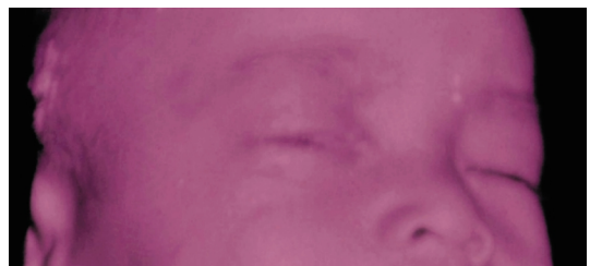
Figure 3 Showing both eyelids of right eye stuck together with superglue on the medial half; superglue above the right ear, right temple area (white spots).

Next day, the conjunctival abrasion and corneal abrasion were found to be less in size. Cyclopentolate eye drop was put and eye ointment was continued tds in right eye. The conjunctival and corneal abrasions healed completely in two days time. The child was discharged on topical antibiotic eye ointment bd in right eye. The baby was followed up after one week and the right was white and quiet. The antibiotic eye ointment was continued at night time for one more week. In the next visit after one month, the eye lashes grew to normal size in the right eye.