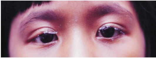
Figure 1 Showing the superglue on the medial 1/3 of upper lid margins in both eyes after separation of both lids.

Case 2 A 3 years old Malay boy was brought to the emergency department at 8.00pm with history of inability to open the left eye for the past 3 hours following accidental putting of superglue by himself while playing with glue. On examination, right eye was normal. Both eyelids were stuck together in the lateral 1/3 of the lids (Figure 2), and the child could not open the left eye completely. The anterior segment was normal. Condition of left eye was explained to parents. Parents were informed that removal of superglue is to be done by trimming the eyelashes in the left eye. Gentamycin eye ointment was put in the left eye and the child was admitted in the eye ward. Next day, eyelashes were trimmed under general anaesthesia and gentamycin eye ointment was put in the left eye. The child was discharged on gentamycin eye ointment at night and followed up after two weeks. Left eye was normal. Gentamycin eye ointment was stopped. In the next visit after one month, the eye lashes grew to normal size.