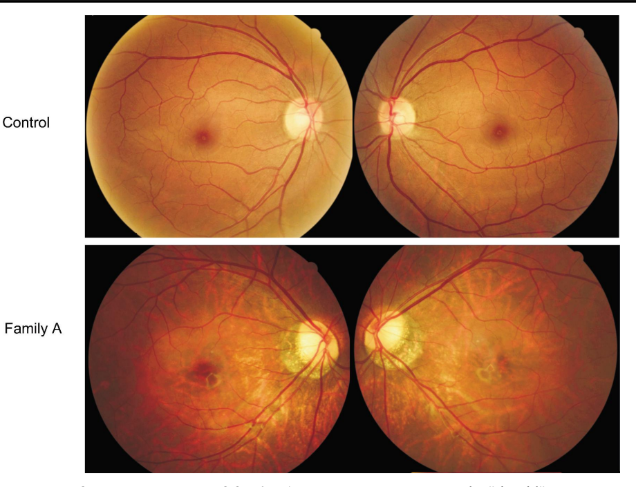
Figure 3 Fundus photographs form the proband of family A and normal controls The "tigroid" appearance of the posterior retina and the optic nerve head crescent, which typical of high myopia were observable in patients in family A and B.

mutations in exon 24, leading to a p.Ala1088Thr substitution, and c.3250T>C, causing a p.Cys1084Arg substitution. The bilateral sphere refraction of the 3-year-old proband was -5.75 D (OD) and -5.50 D (OS). Strabismus was detected in this individual, but nystagmus was not found by the ophthalmologist. According to his parents, the proband was afraid of playing alone in dim environments. Unfortunately, this patient's ERG was unavailable. Therefore, we could not clearly diagnose whether he had high myopia with or without CSNB1. Because DNA samples from his family members were unavailable, the compound heterozygous mutations detected in this boy were confirmed via clone sequencing.