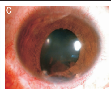
Figure 1 External eye images A: A grayish pink tumor with uneven surface and rich neovascularization in the anterior chamber (this photo was taken in the local hospital); B: The mass grew rapidly and compress the iris posteriorly, with visible pupil transformation and hyphema; C: Local iridocoloboma and posterior synechia after the operation.