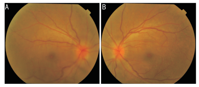
Figure 1 Bilateral hyperaemic and swollen optic disc with mild vitritis.

A diagnosis of ocular syphilis with HIV co-infection was made. Patient was co-managed with an infectious disease (ID) physician. He was admitted and treated with 24 million units (MU) of aqueous crystal penicillin G per day, administered as 4 MU intravenously over 4h for 14d. Oral prednisolone therapy was also prescribed at 50 mg per day for 2wk followed by tapering dose. One day after starting the penicillin treatment, he developed a fever, presumed secondary to a Jarisch-Herxheimer reaction but it resolved spontaneously.