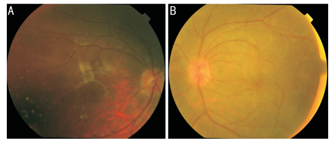
Figure 4 Colored fundus photos of both eye A: Normal right fundus. B: Left fundus showing vitritis, hyperaemic and swollen optic disc.

Syphilis is a multisystem, chronic bacterial infection caused by the spirochete Treponema pallidum . Treponema pallidum