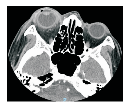
Figure 3 Contrast-enhanced computed tomogram of the orbits shows proptosis and vitritis of the right eye, without retrobulbar involvement.